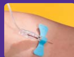
Flash visualization confirms venous access