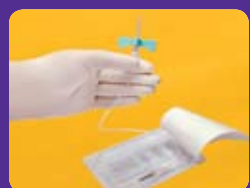
Memory-free tubing: Tubing does not coil or curl