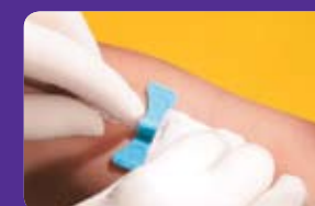
Needle retracts from the vein and locks into place, offering immediate protection against needlestick injury

View the BD Vacutainer® Push Button Blood Collection Set in action and learn more about this innovative advance in safety and satisfaction: www.bd.com/vacutainer/producttraining