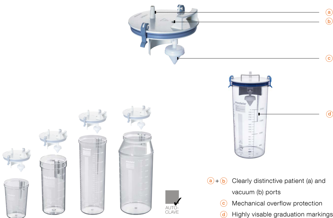
Reusable jars of 1, 2, 3 and 5 litres

Based on our long experience in Medical Vacuum Technology, we design and manufacture our suction pumps, Fluid Collection Systems and accessories to fit a wide variety of different clinical settings and applications. Whether you need a complete system or a specific component, we are happy to advise.