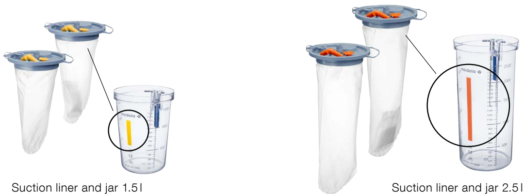
Suction liner and jar 1.5l

Distinctive colour coding for less confusion: orange liner into orange coded jar; yellow liner into yellow coded jar.