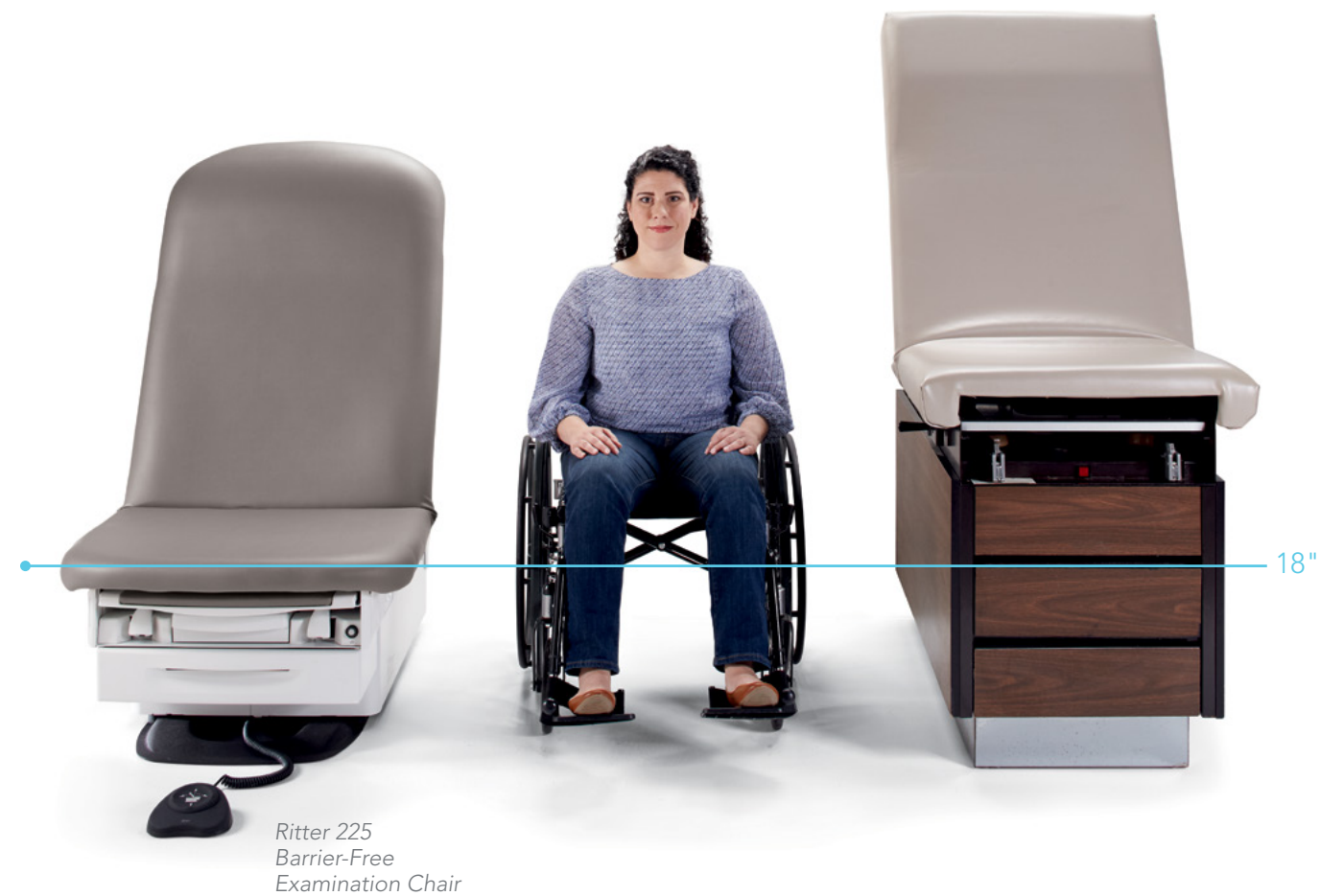
Ritter 225 Barrier-Free Examination Chair

Ritter Barrier-Free Examination Chairs by Midmark adjust in height from 18-37 inches, improving accessibility to the exam chair and reducing the likelihood of staff injury. In a recent study, caregivers reported dramatically less perceived physical exertion when using a height-adjustable exam chair versus a fixed-height table. In fact, results showed an actual 95% to 98% reduction in perceived physical exertion. 4