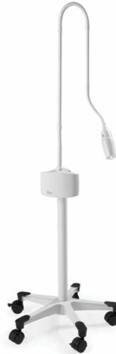
Mobile Ritter 253 LED Exam Light with caster base