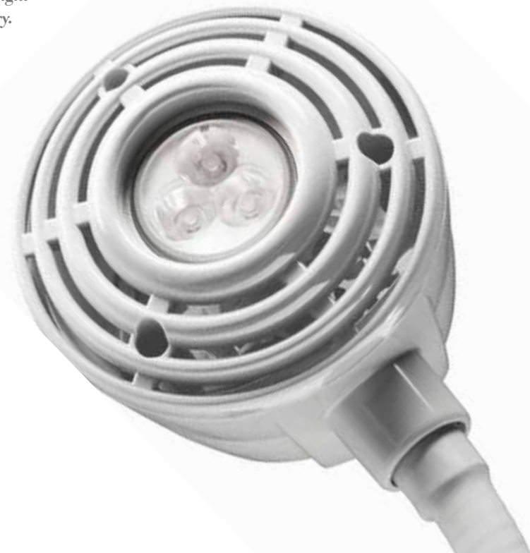
Ritter 250 LED Exam Light