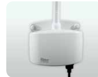
Wall mount bracket