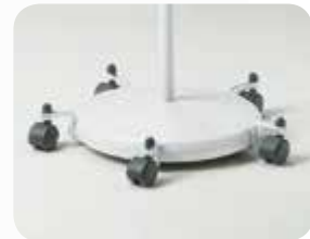
Add mobility to the 250 exam light with the optional base accessory.

The Ritter 250 LED Exam Light takes our proven exam room lighting and makes it even better by incorporating LED technology for longer life and reduced energy consumption.