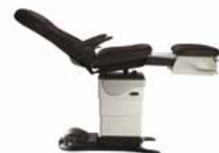
Standing Exam Position