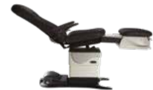
Seated Exam Position