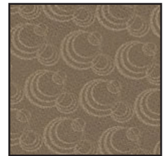
CHAMPAGNE BUBBLES DARK