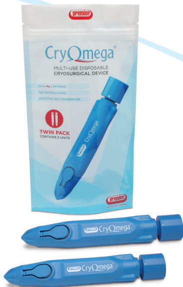
9034002 CryOmega® Twin Pack Contains 2 CryOmega units, each containing a 16g nitrous oxide (N 2 O) cartridge for your convenience.