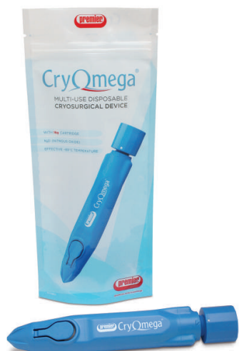
9034000 CryOmega® Disposable cryosurgical unit containing a 16g nitrous oxide (N 2 O) cartridge.