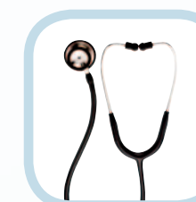
PROFESSIONAL ADULT STETHOSCOPE 5079-135