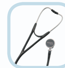
HARVEY DLX DOUBLE-HEAD STETHOSCOPE 5079-325