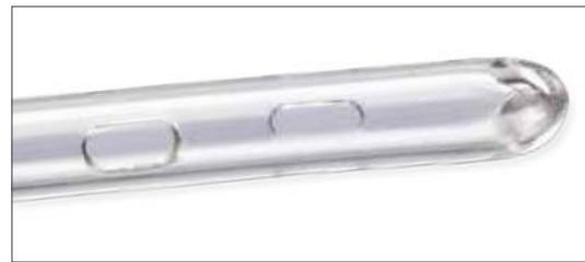
Smooth eyes minimize urethral trauma. Clear vinyl intermittent catheter shown (item no. DYND10702).