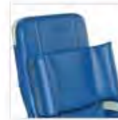
Torso Support TS00