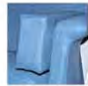
Side Cushion SC00