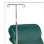
IV Pole IV