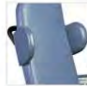
Lateral Support LS00